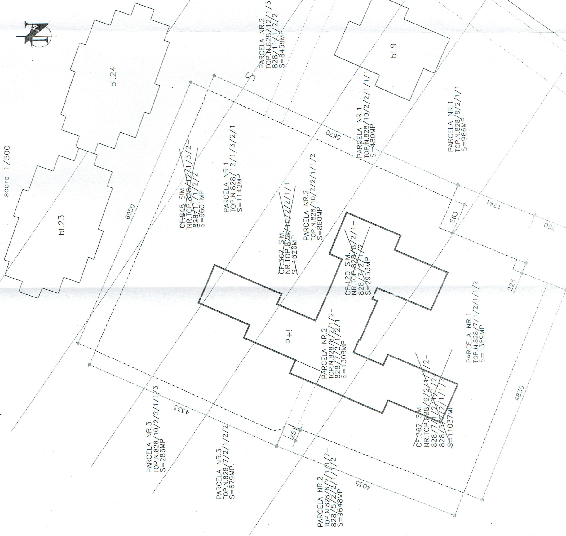
TABEL DE DEZMEMBRARE